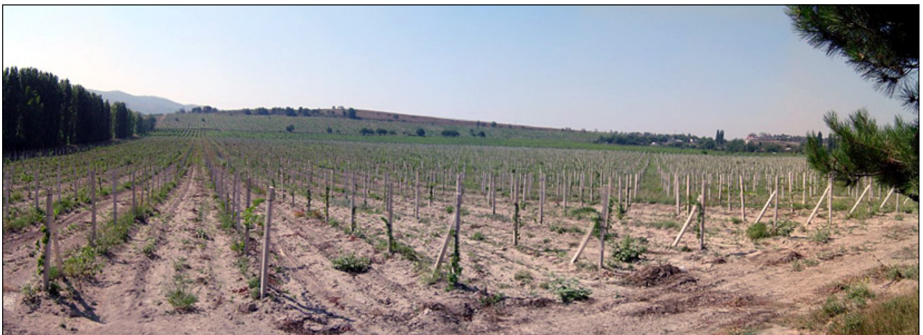
Above- the "Valley of Death" today