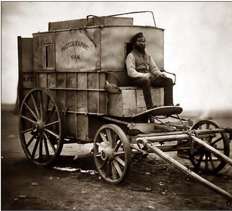
Left Photo-graphic van