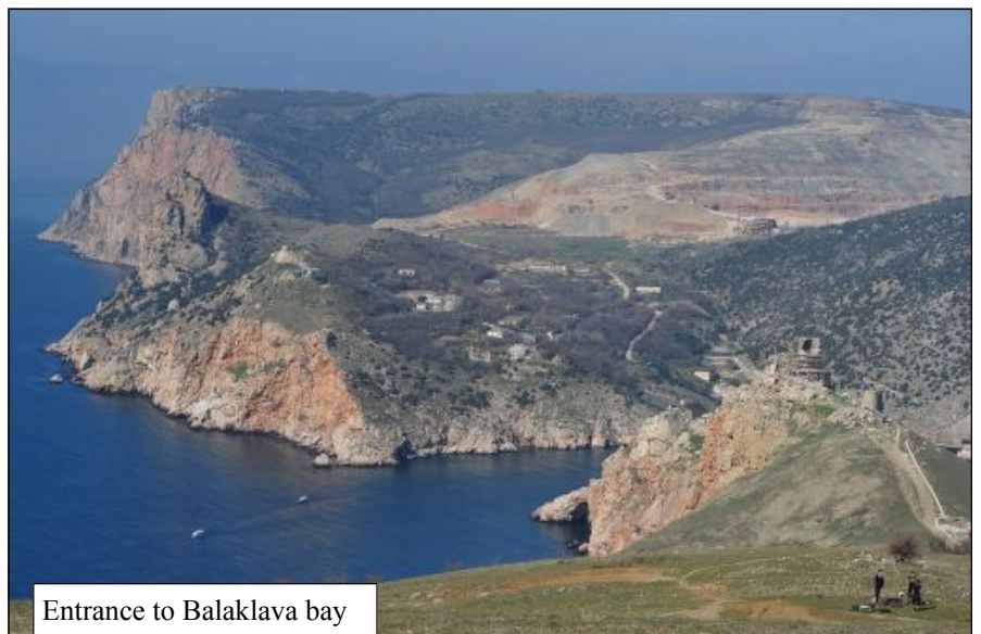
Entrance to Balaklava bay