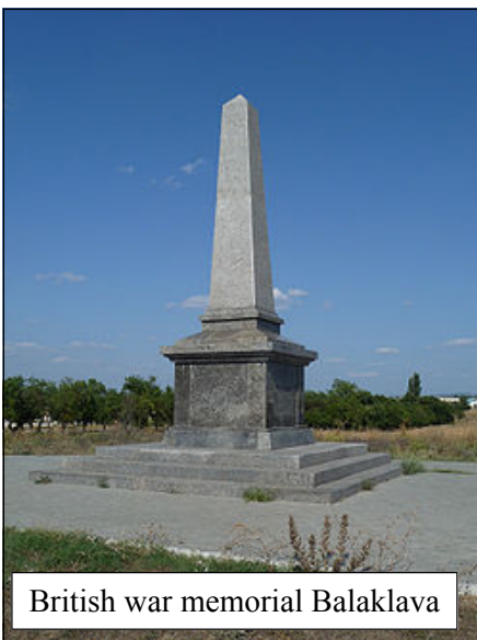
British war memorial Balaklava